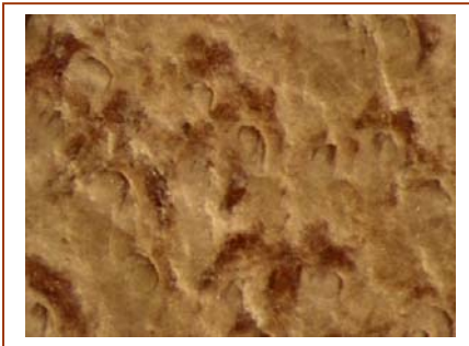
Figure 2 Normal area