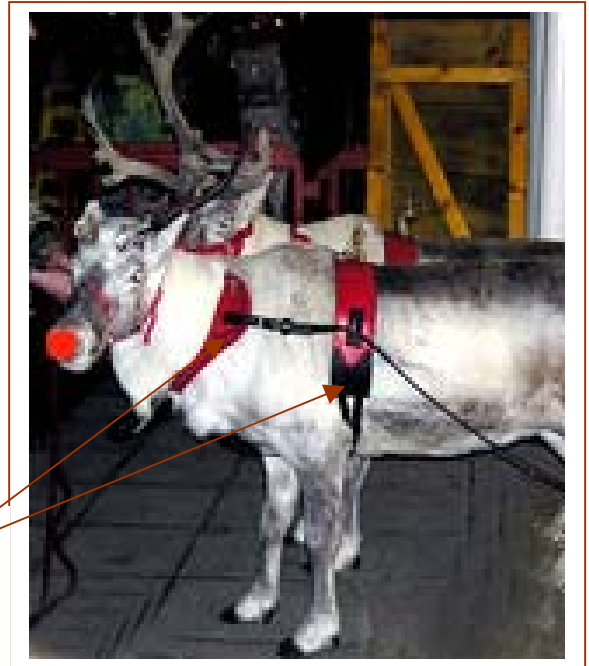
Figure 3 Locations where abrasion has taken place

An excess of fat and a harness that is suddenly too tight indicates that there has been a rapid expansion in body mass whilst the animal was working. This is likely to have been due to an over consumption of fattening foodstuff in a short space of time.